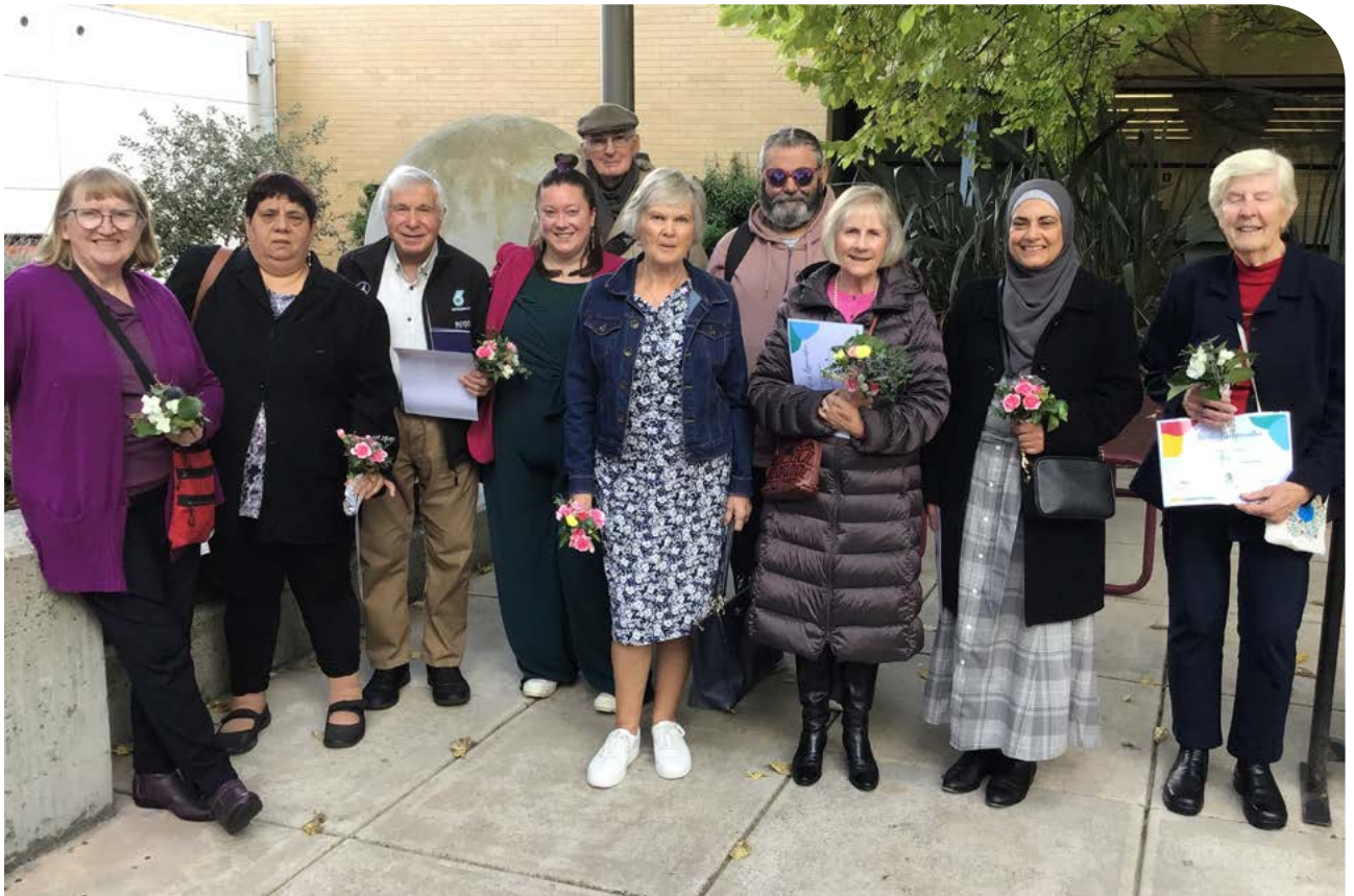
Volunteer's Lunch 2023