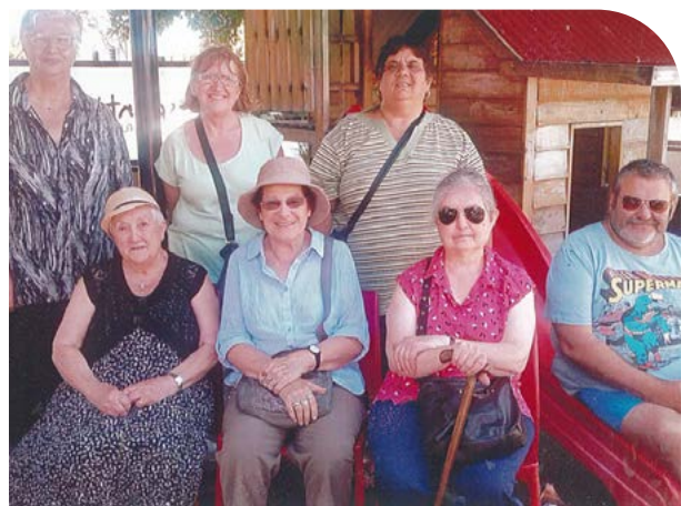
Photo shows a tram excursion to Port Melbourne where we enjoyed a stroll along the beach and a fish and chip lunch.