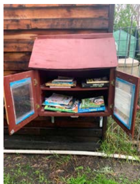
Little Libraries (adults and children)