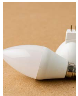
LED light fittings