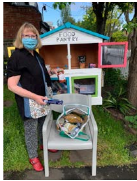
Community Food Pantry