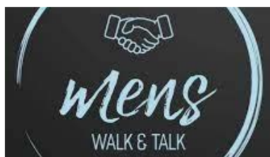
Men's Walk & Talk Group