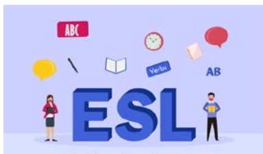
English as another Language