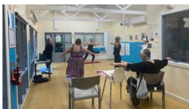
Wise Moves Stretching Class