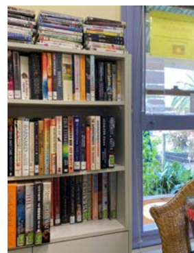
Holden Street house Library